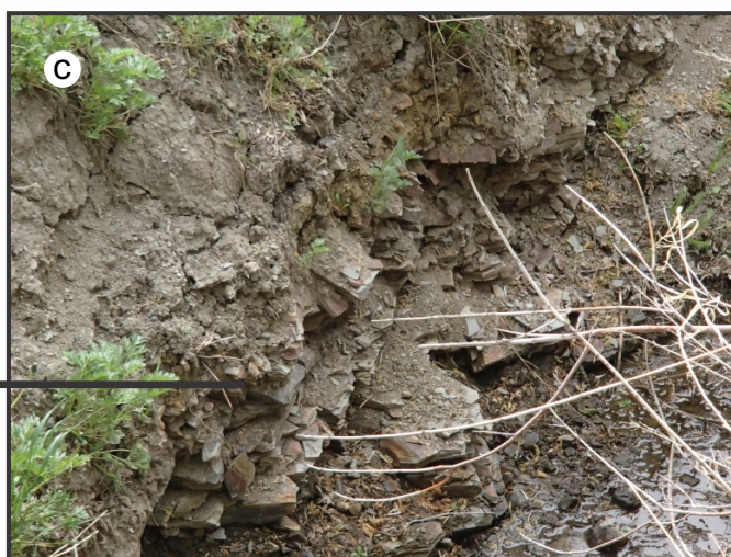
Figure 26: Photos of sediments present at section 15112TH069: a) view of the stream cut exposing sediments; b) upper alluvial sediments and underlying tills. Contacts are highlighted by the white dashed lines; c) Odanah Member bedrock exposed at the base of the section.